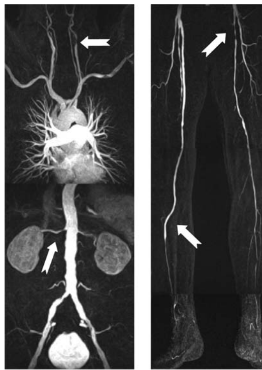
Figure 1 Magnetic resonance angiograms of a 66-year-old man, showing diffuse atherosclerosis, upper and lower extremity disease, carotid, and renal artery stenosis.

In order both to assess the vascular system and to detect organ damage, a special whole-body vessel and organ protocol has been developed. 13 Three different examination parts are used: the head, the heart, and the whole-body arteries. After pre-contrast imaging of the brain, whole-body MRA is acquired after intravenous contrast injection, using circular polarized head array coils and spin array coils integrated into the scanner table, as well as body array coils